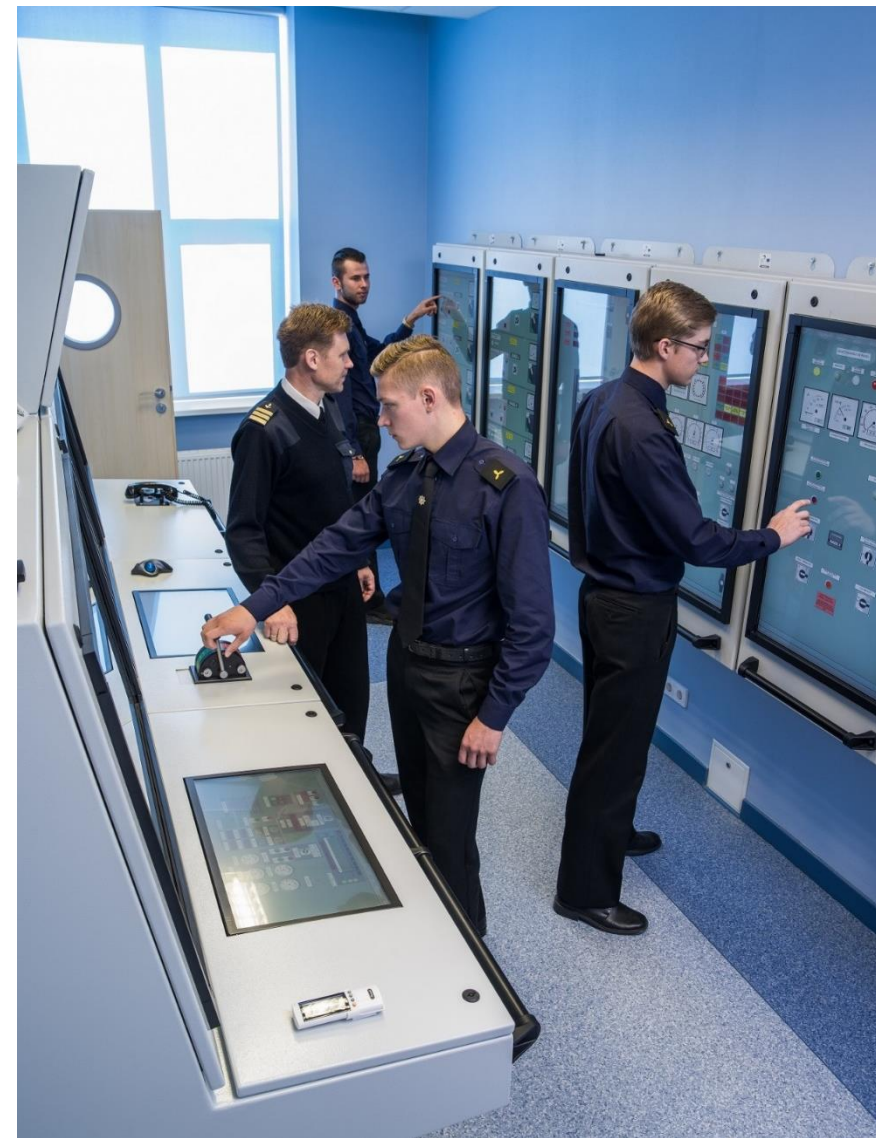
Partners: Liepaja Marine College, Lithuanian Maritime Academy