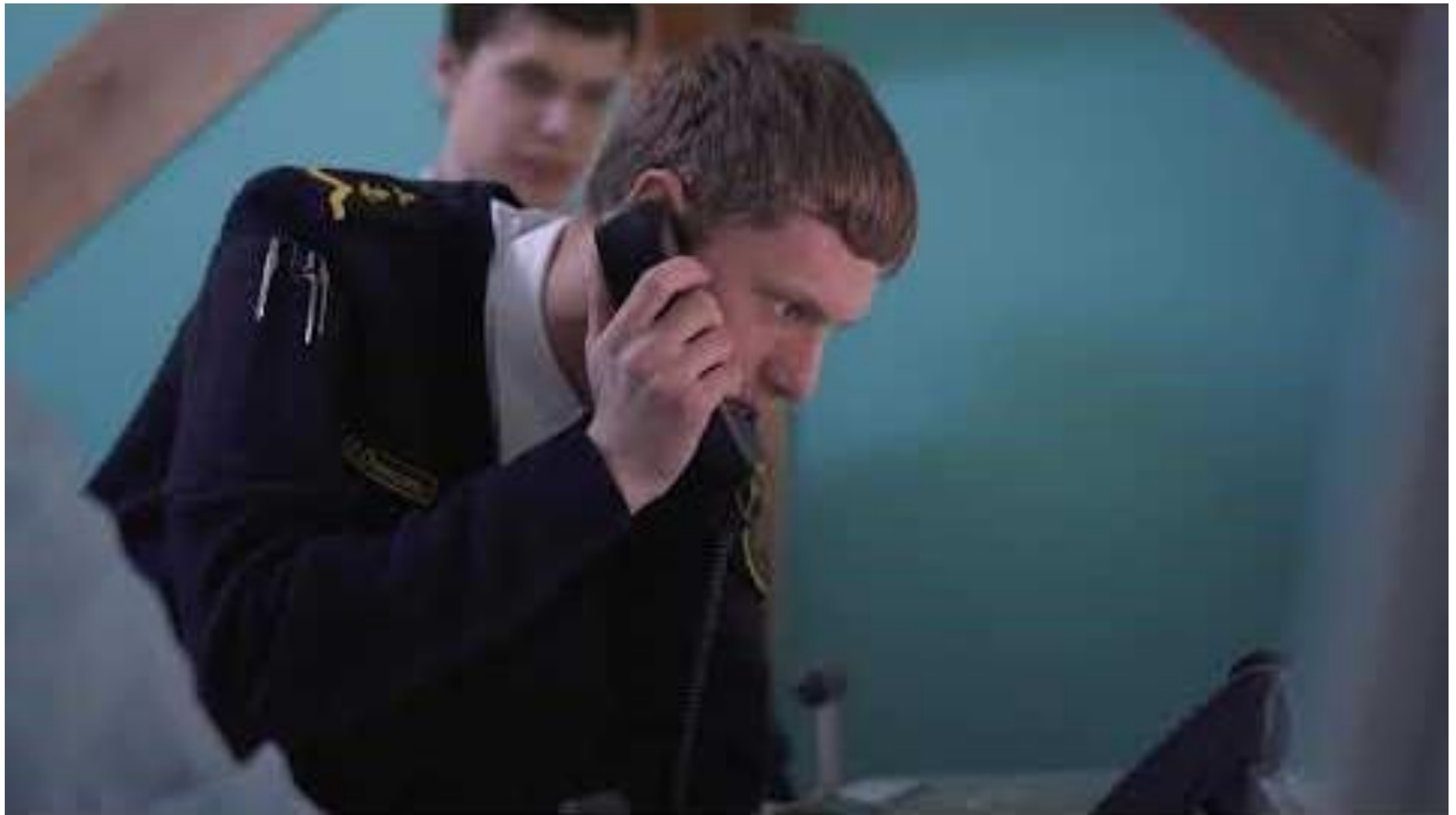
LLI-42 LatLitNaviPort on-line video